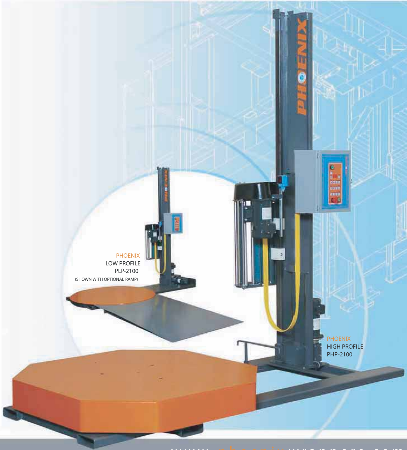
PHOENIX LOW PROFILE PLP-2100 (SHOWN WITH OPTIONAL RAMP)