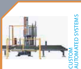
CUSTOM AUTOMATED SYSTEMS