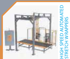
HIGH SPEED AUTOMATED STRETCH WRAPPERS