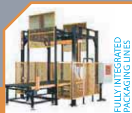
FULLY INTEGRATED PACKAGING LINES