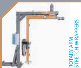
ROTARY ARM STRETCH WRAPPERS